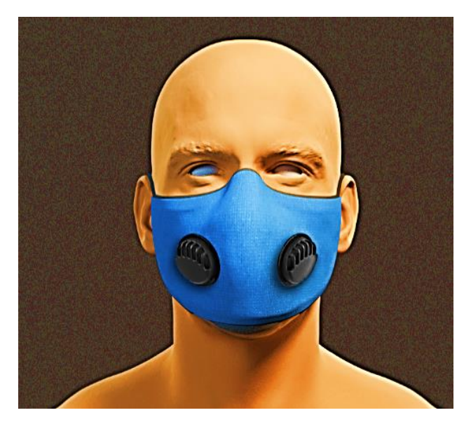
Figure 4 – The designed mask with a double filter

To guarantee a more secure mask fixation, its version with ear hooks like those used in glasses is proposed. Variants with separate filtering elements are presented in Figure 3 (a single filter) and Figure 4 (a double filter).